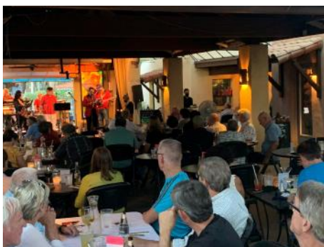
The Red Concert at Monterey Court, a benefit for TIHAN and the Center for Health and Hope, raised almost $20,000.