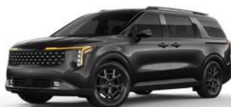
New 2025 Kia Carnival Hybrid SX Prestige

Every ticket we sell will help fund our programs!